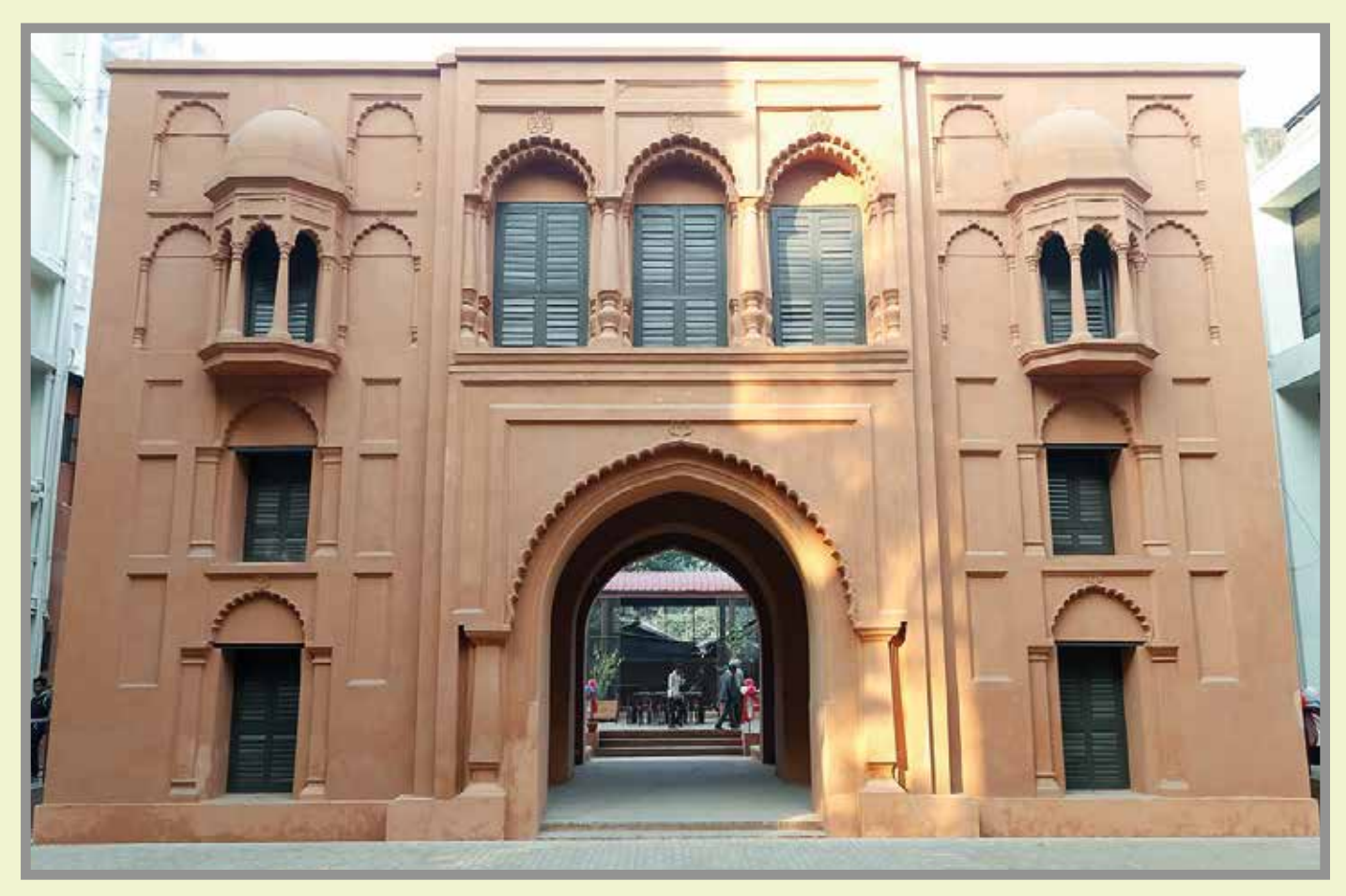
Asiatic Society Heritage Museum