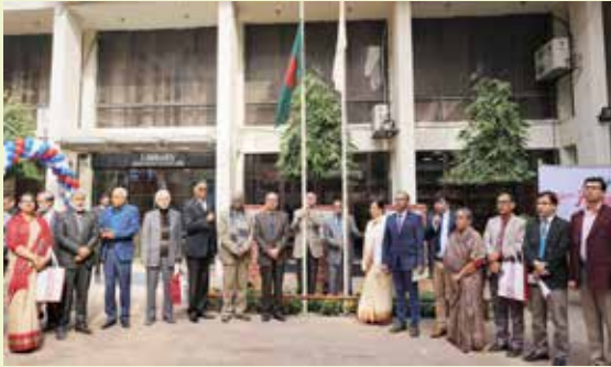
The Inauguration of 72 nd Foundation Day of Asiatic Society of Bangladesh