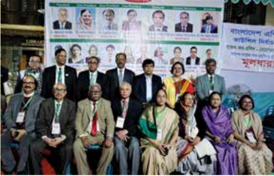
Some of the Participants and Candidates of ASB Council Election held on 30 January 2024

Election paves the way for new changes in leadership, dynamism and optimism in activities among the members of Asiatic Society of Bangladesh. As the Society cherishes the values of democracy, transparency and accountability in all its activities in order to dispel the general notion that there is less scope for the common members to have any participatory role in the Society's highest body. Members of the ASB decide its future leadership and its course of actions.