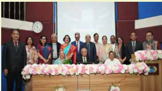
Stage photo-session of 20 th Biennial General Meeting held on 10 February 2024