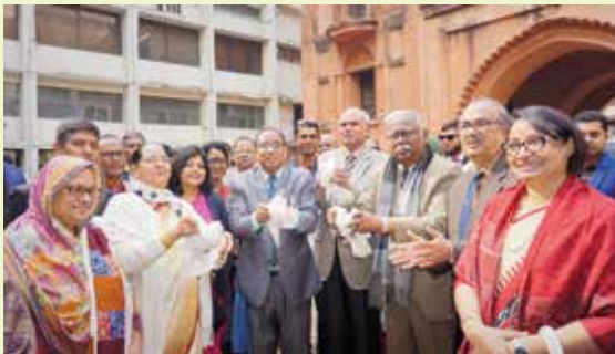
Pigeons are being flown as a symbol of peace on the occasion of 72 nd Foundation Day

The General Secretary pointed out that the Council of 2022 and 2023 took charge of the Society with the mission of ensuring accountability and transparency in ASB's all kinds of activities