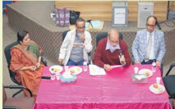
The Election Commission declaring the ASB Election Results held on 30 January 2024

After counting the votes, the election commission declared the election results of the new Council for the years 2024 and 2025 of Asiatic Society of Bangladesh.