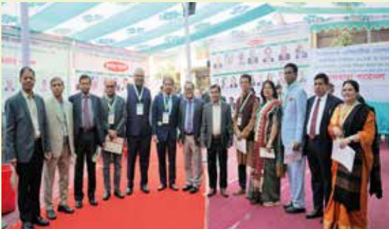
Some of the Participants and Candidates of ASB Council Election held on 30 January 2024

The General Secretary placed these Panels before the Council meeting on 05 December 2023 and the Council endorsed both Panels as valid.