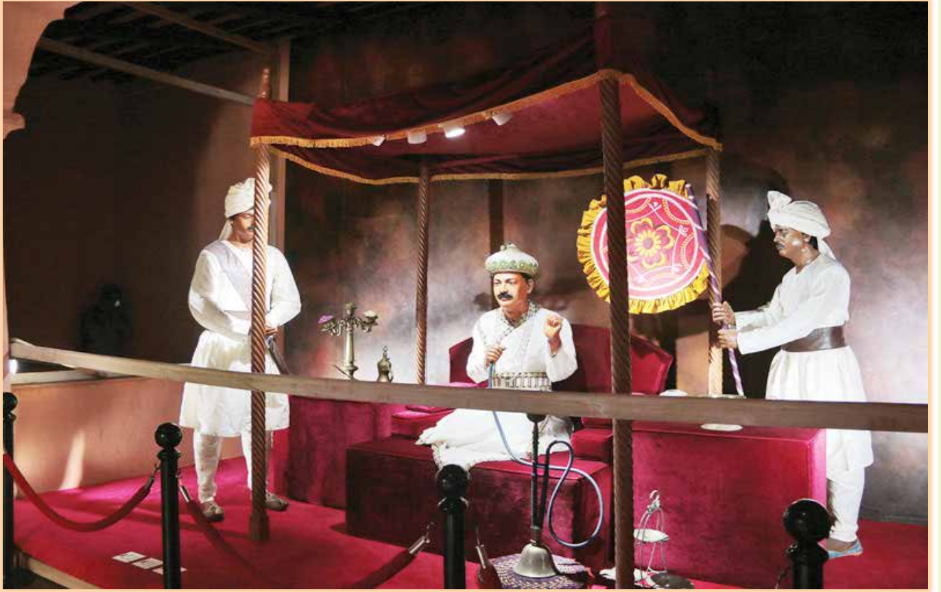
Diorama: Court of Naib Nazim Nusrat Jung (Asiatic Society Heritage Museum)