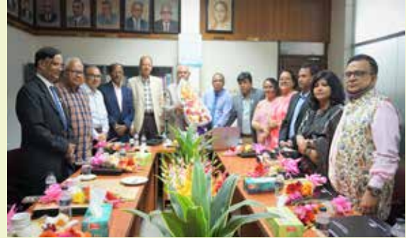
The outgoing Council congratulating the newly elected Council in the Joint Council Meeting

A Joint Council meeting is held after every two years. In this meeting the outgoing Council and the newly elected Council meet together and the outgoing Council hands over their responsibilities to the new Council for the next two years. This is one kind of common practice of Asiatic Society of Bangladesh. This year the Joint Council meeting was held on 22 February 2024 in the Society's Council Room where the outgoing Council (2022-2023) handed over responsibilities to the new Council (2024-2025).