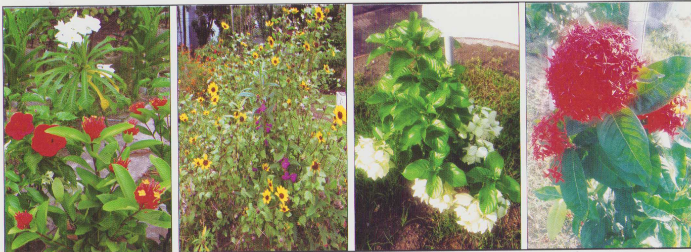
ASB Garden plants in flower