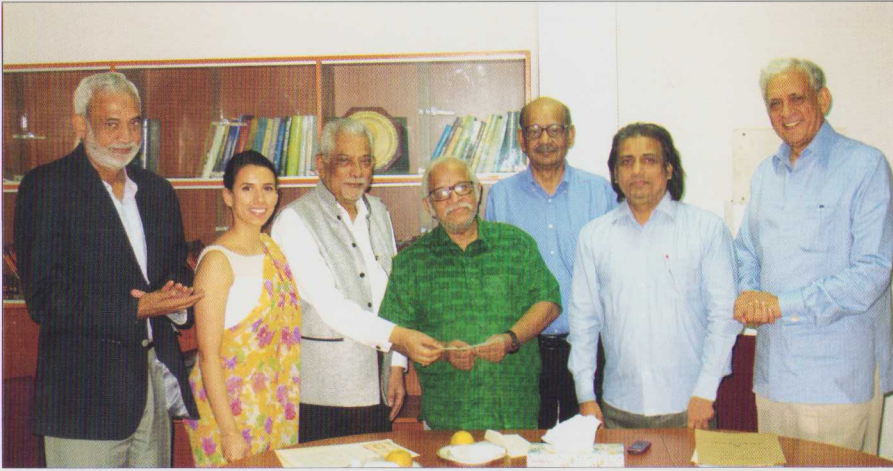
Endowers of S.N.H. Rizvi Memorial Trust Fund are seen handing over the cheque for TK. 10,00000/- to the Society.

the USA, would render it into another Vietnam War. In order to achieve liberation by that time, active Indian participation would be necessary, and India could participate fully only when the Himalayan passes were covered with snow, making it impossible for the Chinese forces to interfere. All his energies were directed towards that strategy. His government had clearly told India that the Indian forces would get into Bangladesh as a 'supporting force' and that they would leave the Bangladesh soil when Bangladesh would feel that their presence was needed no longer.