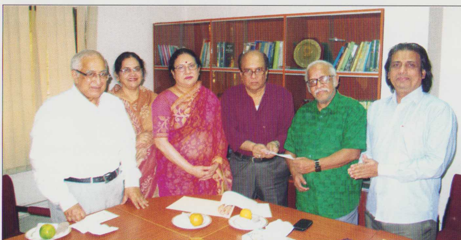
Endowers of the Dr. A.R. Mallick and R.N. Mallick Memorial Trust Fund handing over the cheque for TK.10,00000/- to the ASB President and General Secretary of the Society

From the very beginning Tajuddin Ahmad did aim to achieve the liberation of the country by the winter of 1971. He reckoned that had the war lingered, Pakistan, with the backing of