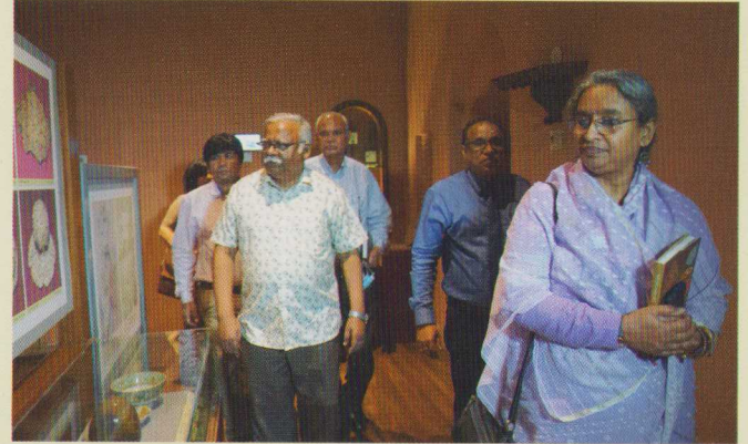
Dr. Dipu Moni, Honorable Minister, Ministry of Education, paid her visit to the Asiatic Society Heritage Museum on the occasion of its 4 th Foundation Day

The Asiatic Society Heritage Museum is the Society's pride and unique asset. The 4 th Foundation Day Program of the Heritage Museum was held on Tuesday, October 11, 2022, at the Society's Auditorium.