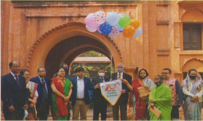
The Inauguration of 70 th Founding Anniversary of the Society