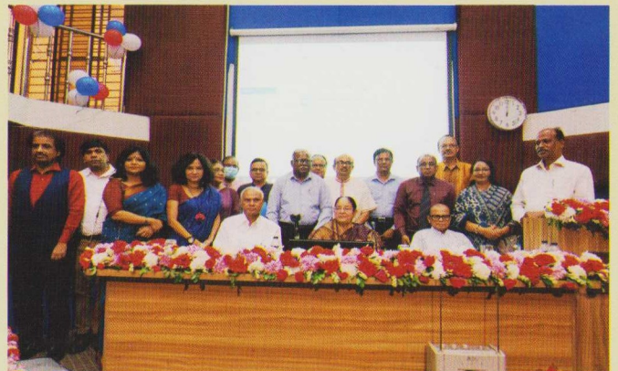
19th Biennial Program held on May 21, 2022