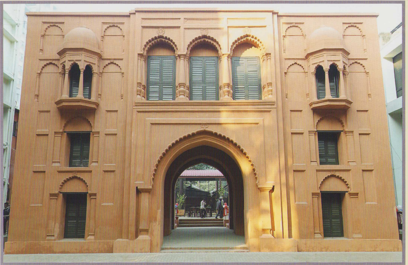
Asiatic Society Heritage Museum