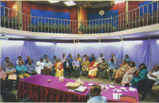
The Election Commission is declaring the election result at the auditorium of ASB