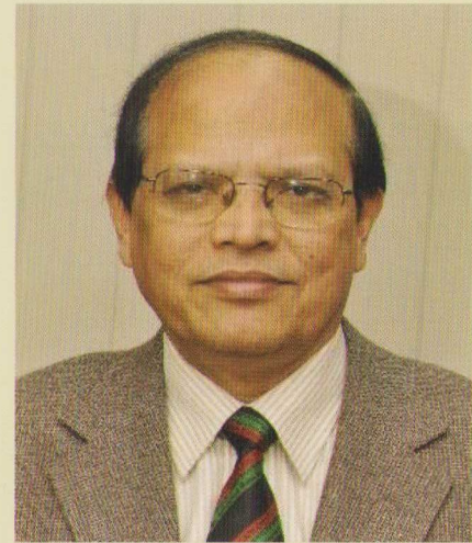
Professor Atiur Rahman, 70 th Foundation Day Speaker of the Asiatic Society of Bangladesh

Dr. Atiur Rahman , Professor, Department of Development Studies, University of Dhaka and Former Governor, Bangladesh Bank was the Foundation Day speaker. He delivered the Foundation Day Lecture titled The Indomitable Bangladesh: An amazing journey of inclusive and sustainable development.